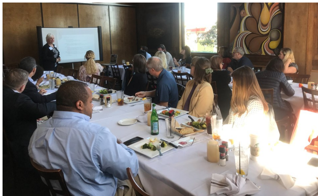
October Lunch & Learn in Murfreesboro, TN.