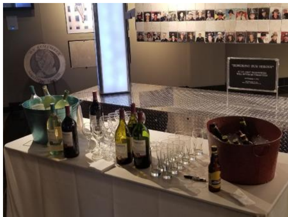
Beverages — provided by McCullough and Associates. — with the Memphis Fire Department Memorial Wall in the background.

The Southeast Chapter wishes to thank all of our generous sponsors, for their contributions and door prizes in support of our annual Supplier's Social event.